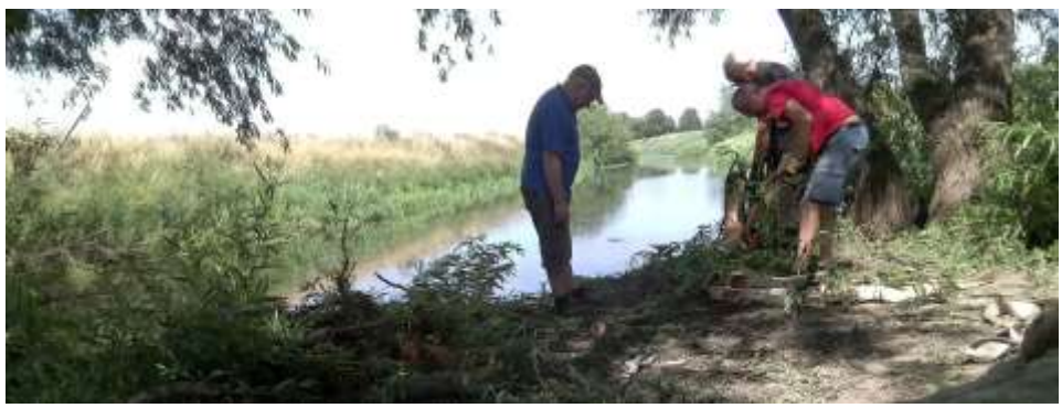
Taylors Lock....Assessing the situation

These have continued in a socially distanced fashion with activities at Taylors Lock and Cogglesford. In accordance with Covid 19 regulations, there was no car-sharing and thermos flasks took the place of the usual communal brew!