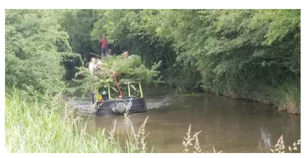
By arrangement, some excess branches and vegetation were also tidied along the river in South Kyme.