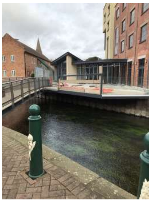
The new jetty... work in progress

homage to the buildings that have housed us - The Pearoom in Heckington and Hubbards Seeds in Sleaford.