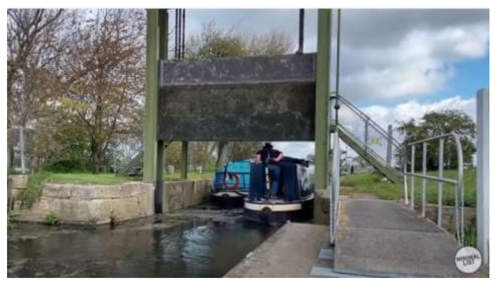
Minimal List Perseverance and friends entering Taylors Lock heading downstream below South Kyme

The IWA's Silver Propeller Challenge has inspired boaters across the country to visit waterways less travelled and those who take part record their journeys, with photographs as proof, and score points towards an award. Partly motivated by this, two celebrity boating vloggers Minimal List have posted over 380 YouTube videos of their river and canal journeys.