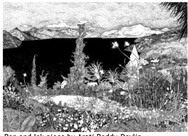
Pen and Ink piece by Arati Reddy-Devlin

Our main gallery exhibition by Jo Fairfax celebrates movement, sound and place through a range of public realm works featuring mechanics, light, poetry machines, interactive film projections and walls of tiles. Play also showcases a new commissioned artwork that pays