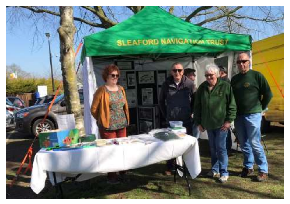
Our stand at RiverLight and, below, being visited by a pair of wandering pigeons...