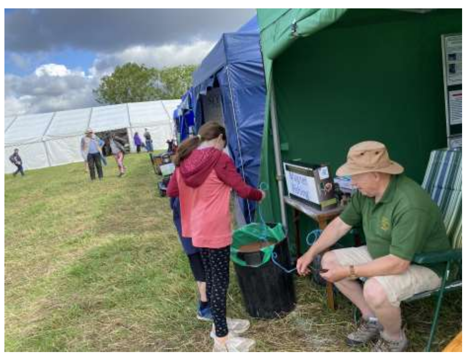
Heckington Show 2023