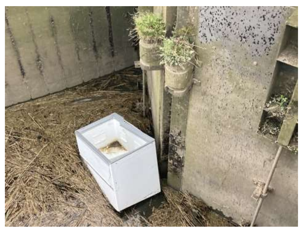
Entrance to the Old Bedford River

We launched the "Protect Our Waterways" campaign in March 2023 and, by joining IWA, you will strengthen our voice.