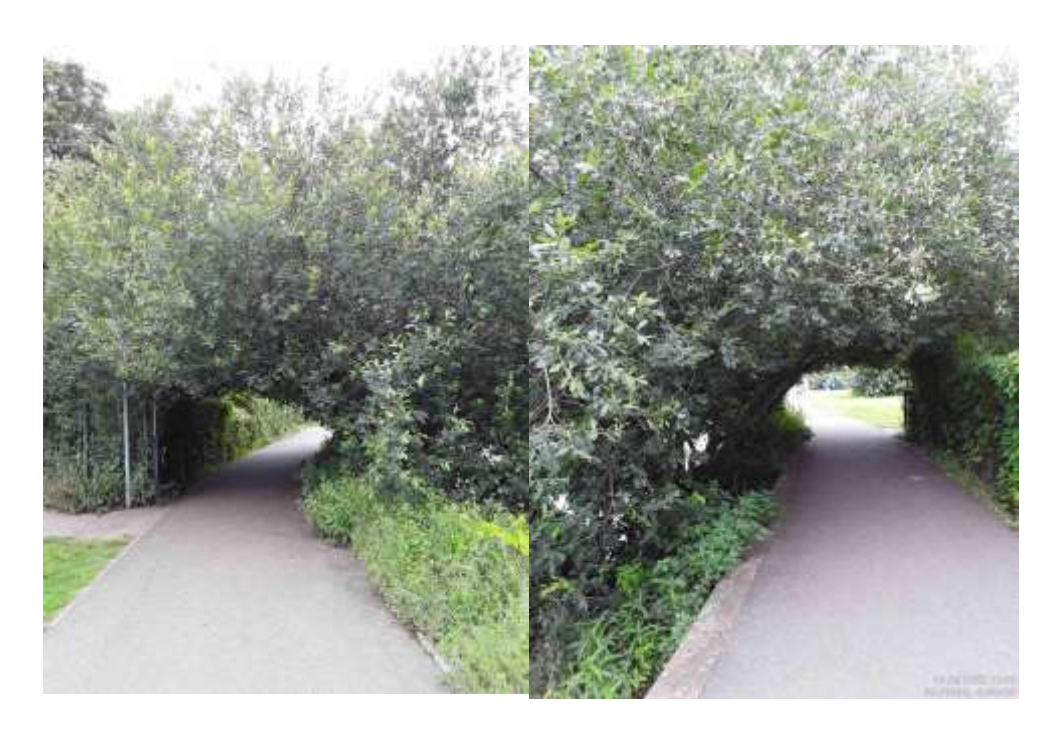
Before (above) and After (below)