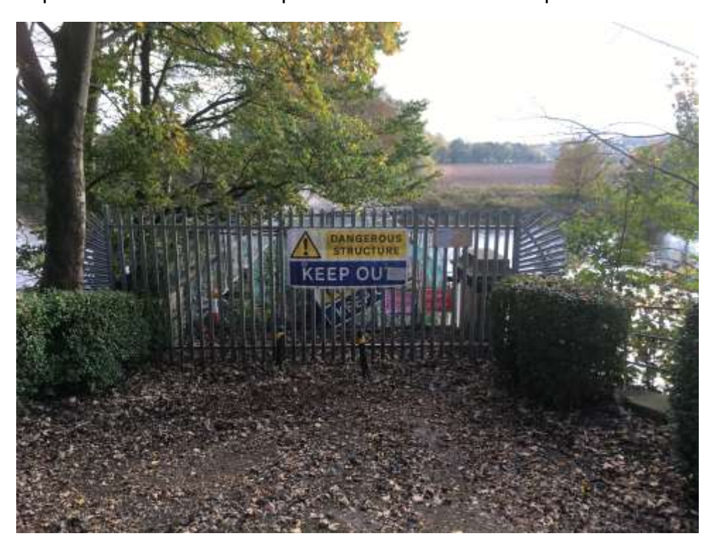
Old Tram Bridge carrying the tramroad linking the two sections of the Lancaster Canal across the River Ribble in Preston: photo supplied by IWA

untenable. You know better than anyone that it is far more costly to repair and restore than to prevent decline in the first place.