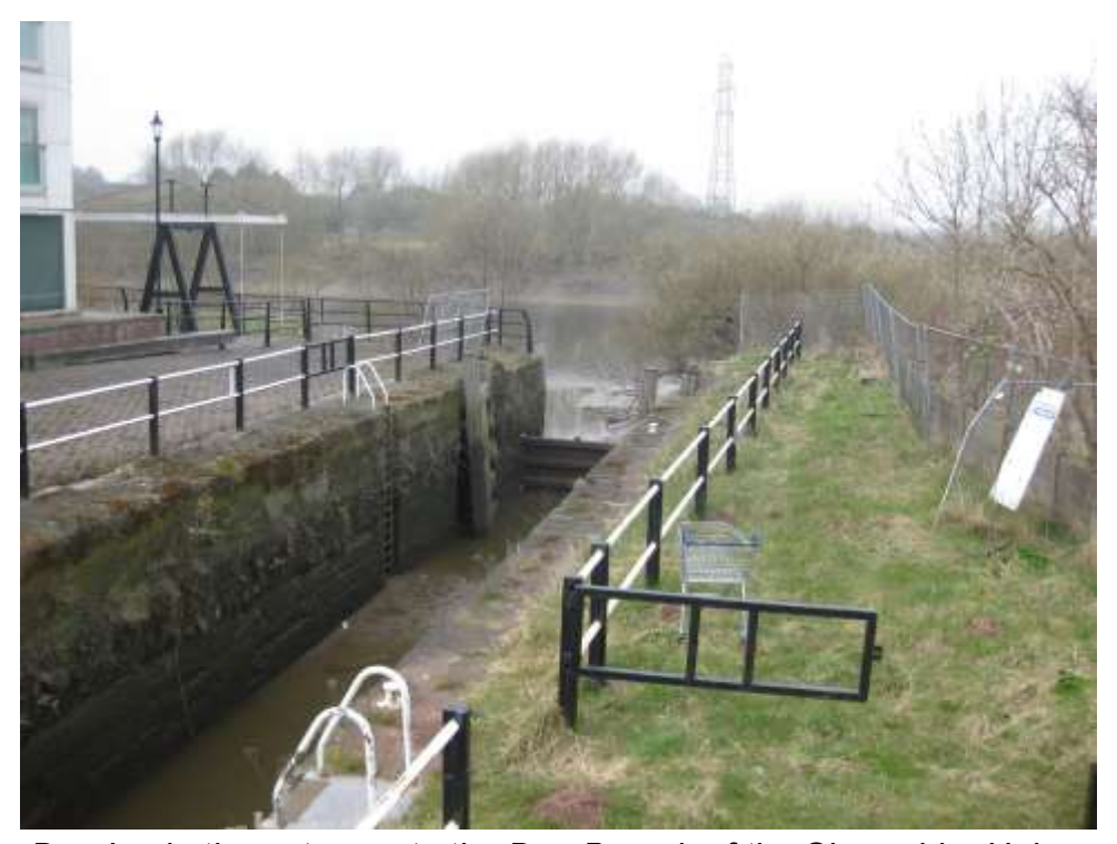
Dee Lock, the entrance to the Dee Branch of the Shropshire Union from the River Dee in Chester

Only IWA provides this range of support to the waterways family, but now we need every member of this society to help to reverse the damaging decision. Restoration projects will become