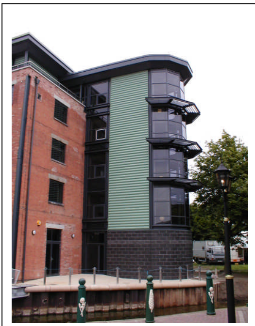
The Hub, Sleaford

The refurbishment of the former Hubbards seed warehouse that stands in one corner of Navigation Yard on the opposite bank to the Barge & Bottle is nearing completion. A recent 'topping out' ceremony took place that saw local dignitaries laying the final piece of stonework. The Hub restoration project has cost £2.4 million and will house a 2D arts workshop, gallery and exhibition centre. It is reported to have wonderful views over the town and gives visitors a birds eye view of the River Sleas - hopefully it will not be too long before that view includes a boat or two, a true indication that the restoration of the Navigation has been successfully completed.