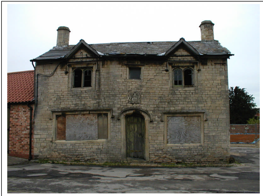
Navigation House, Sleaford

The elaborate building known as Navigation House, built in 1838 for the Sleaford Navigation Company, was designed to house the weighing office and the clerks dwelling. As such it played a key role in the history of the Slea in its heyday and continues to do so today as one of the only surviving examples of this type of building in the country. The first phase of restoration work should start before the end of June and is expected to take about six months. Beyond that the interior will be turned into a visitor centre and museum. The work forms part of the Sleaford Pride project and has attracted funding from the Heritage Lottery, North Kesteven District Council, the Single Regeneration Budget and East Midland Development Agency.