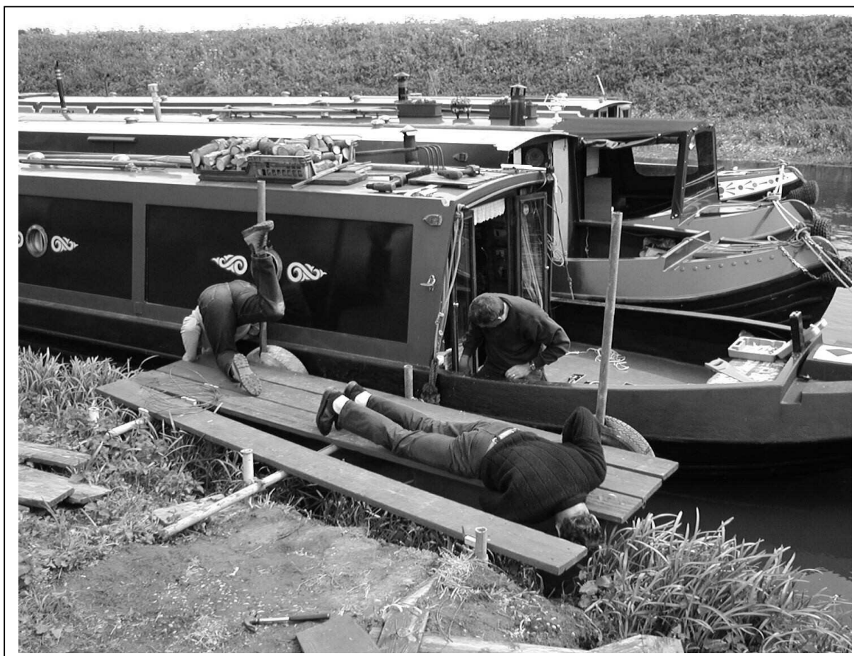
Fixing the new landing stage at Bottom Lock

As ever the welcome in South Kyme was warm and we were particularly grateful to the gentleman who let us moor at the bottom of his garden. An excellent weekend all round.