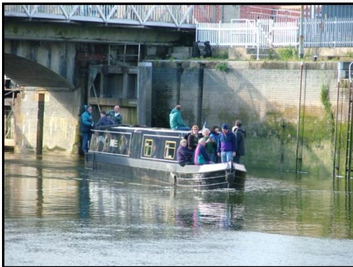
"Jubilee" in Boston

Let's hope that it won't be too long before we can make that journey through on to the Forty Foot.