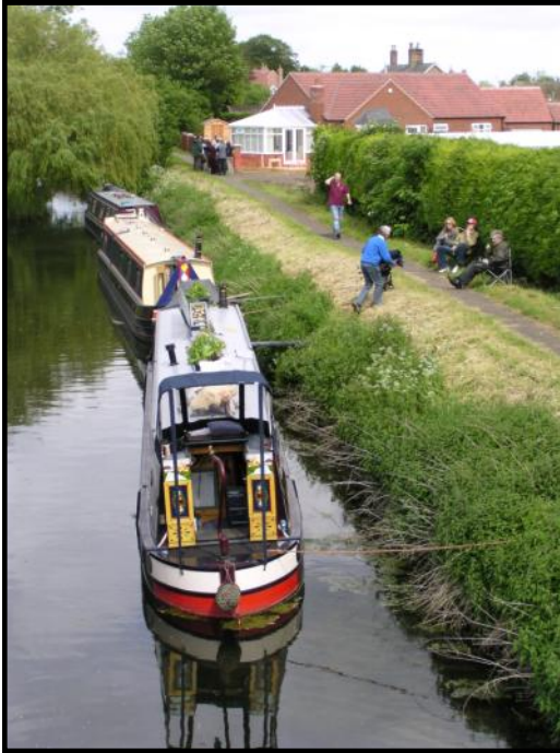
Some more of the boats at South Kyme