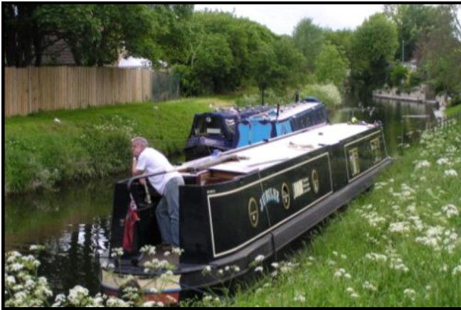
The IWA boat, “Jubilee”

Thanks to everyone who made the weekend such a success. We were promised an even bigger scarecrow competition next year so who can refuse an offer like that?