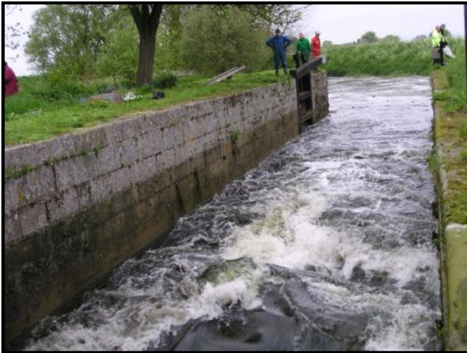
The lock being flushed of blanket weed

After carefully opening the gate (with wet paint) we saw Laura make her way up to South Kyme. The end of a very successful work party.