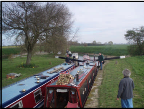
A queue at Bottom Lock and an aerial view of Bottom Lock

When we were at bottom lock by boat we did a bit of finishing off the work from the March work party. Just as Wigford and Florrie Kendal were coming through the lock to turn three boats from the Chesterfield canal arrived to go through up to Cobblers lock. It was good to see 5 boats at the lock and some walkers passing by had never seen a boat at the lock before. They had a very enjoyable trip up, turning at Cobblers proved a challenge due to silting of the river near the bywash but all boats managed to turn and enjoyed the pub at South Kyme on the way back.