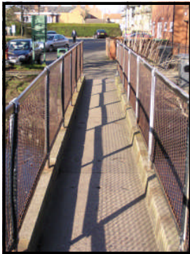
The current narrow New Street Bridge

Sleaford will benefit greatly from the replacement of the New Street footbridge with a new lift bridge. With the funding all now in place, and plans approved it will be a great improvement in the Summer for pedestrians and boaters alike.