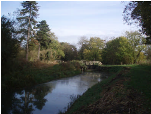
Haverholme from above the Lock

November work party at Haverholme took place on a sunny Sunday as you can see from the enclosed picture. It looks a lot better for a good tidy up and last year's tree branches had dried out enough for Dave Pullen to show his skills at lighting a bonfire. Rob was well into the strimming by the time I arrived and Steve was tree felling by the lock. Before lunch I had a walk past Haverholme road bridge to see the damage to the footbridge over the beck that runs in to the Slea. The remnants of the bridge you can still see in the river (see photograph), it looks like it had been set alight. By 2pm work was complete and the bonfire had done it's job well clearing this years rubbish.