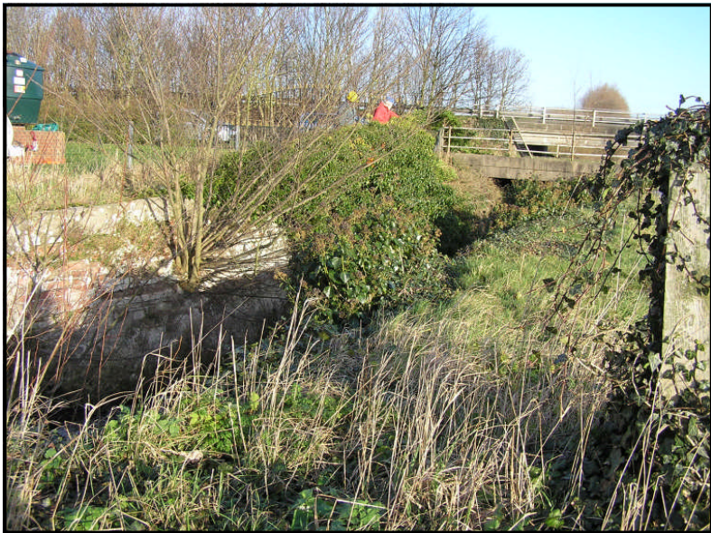
Bone Mill, before work started