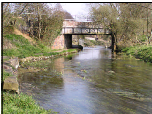
Top: Source of Nine Foot River in Sleaford Fen