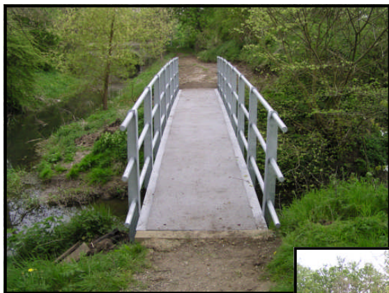
The new foot bridge.

Everyone will be pleased to know that the footbridge over the Ruskington/ Leasingham Beck confluence with the Slea, just below Haverholme has been replaced. The original wooden bridge had been destroyed by arson vandals, as reported in our last newsletter.