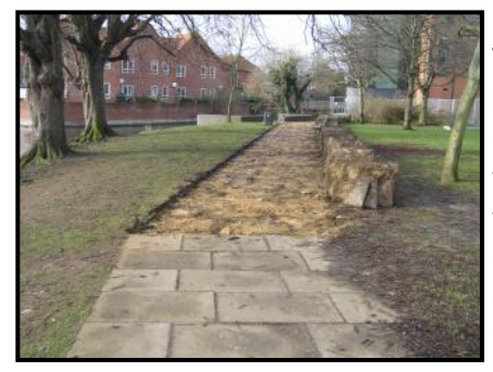
Removal of old path

Work started on the slipway in February and commenced with raising the existing concrete paving pathway which will be replaced by a new block paviour