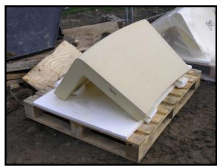
Coping stones

Work has now switched to creating the new path and the reinforced grass access track. Where the path passes close to tree roots a special cellular protection system is being laid under paviour blocks. Likewise a special modular block system is forming the grass track. Both the path and track are completely permeable to rainfall so that the trees and grass will maintain healthy root systems.