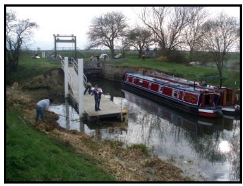
Slipway in the water for the first time

When thinking more and more about the upcoming boat gathering on the 1st of May, it was decided that we should have a leisurely cruise to Cobblers Lock with the idea of some tree pruning and tidying on the way. So three narrowboats, Florrie Kendall, Wigford and Fairies Wear Boots set off for the Easter weekend.