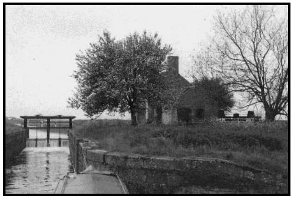
Bottom Lock Island, with cottage

The recent two part article in the newsletter about life in the cottage at Bottom Lock prompted me to search for a couple of photos of my first trip there before the lock re-opened in 1986.