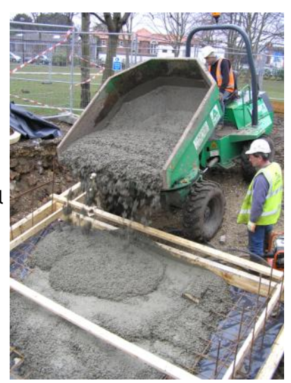
Concreting the slipway

The slipway is now structurally complete and the block paviours below the waterline have