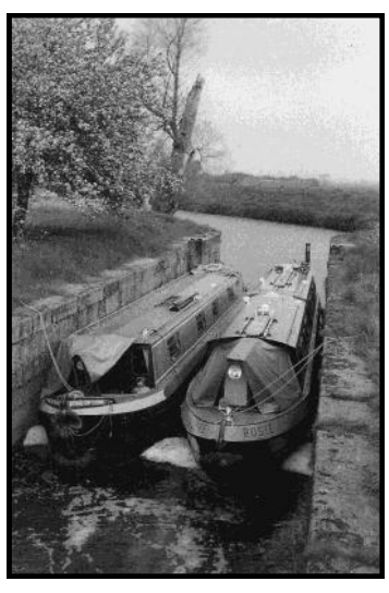
Boats in the lock chamber

The following morning we reversed out and having assisted each other to wind, headed back to the Witham and home to Lincoln.