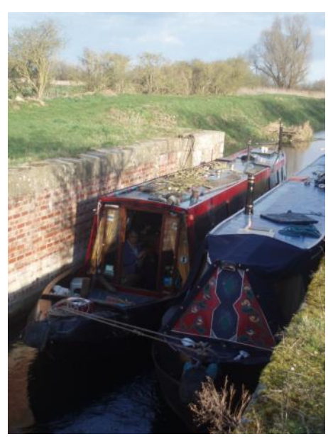
The boats in Cobblers Lock chamber