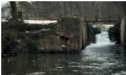
Haverholme Lock c1995

This later picture of the lock, taken exactly one hundred years ago, shows that Haverholme was a popular place to walk on a Sunday as it is today. The gates were still in place if a bit leaky and the lock was beginning to look quite overgrown.