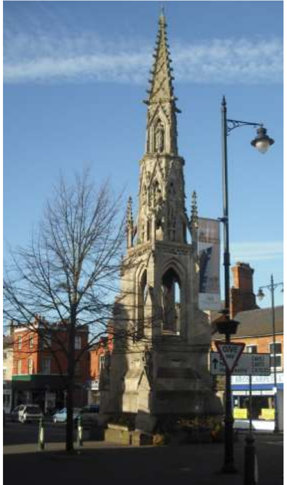
Handley Monument, Southgate, Sleaford

later President of the Royal Agricultural Society. Records of his voting in parliament show his opposition to foreign corn imports, clearly he was all too aware of the economic importance of agriculture to the local economy. During the 1830s he was a