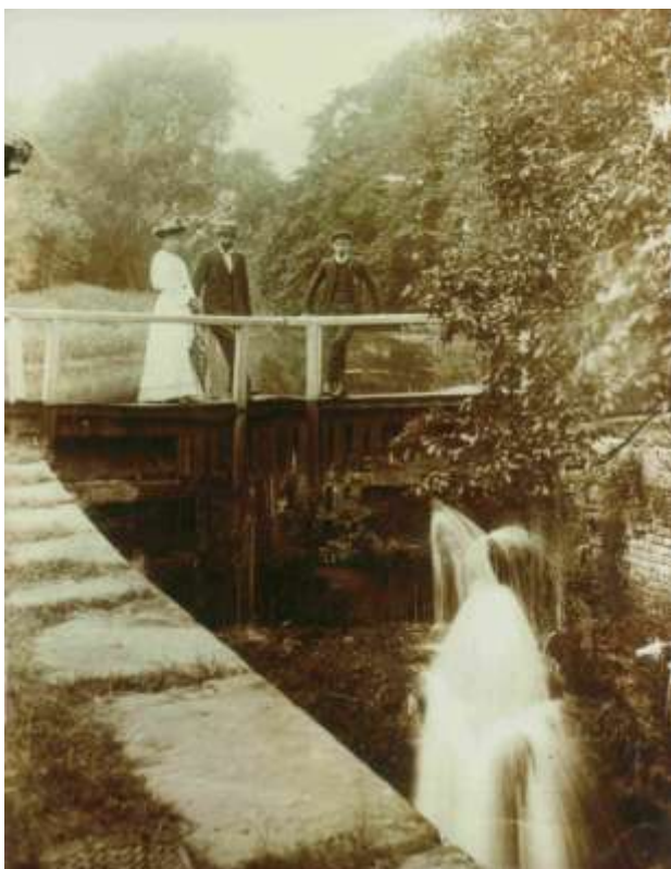
Haverholme Lock c1912

This later picture of the lock, taken exactly one hundred years ago, shows that Haverholme was a popular place to walk on a Sunday as it is today. The gates were still in place if a bit leaky and the lock was beginning to look quite overgrown.