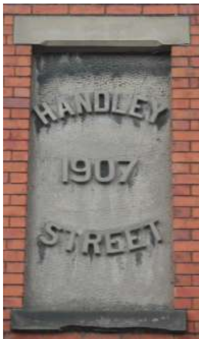
Handley Street: Unusual street sign set in a stone window.

evidence of its occupation by Parliamentary troops during the Civil War was uncovered. The cannon emplacements from which attacks had been made on Newark, together with quantities of damaged gunpowder came to light, as did the skeletons of some hundreds of men buried in rows, without coffins. Presumably they had died in the fighting and been given a speedy burial of necessity. Congregations in the years following probably had little knowledge of the mass grave beneath them or indeed of the quantity of potentially unstable gunpowder stored nearby!