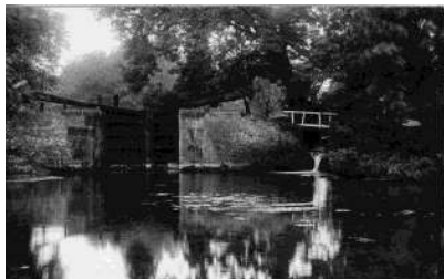
Haverholme Lock c1890

The photo was Haverholme Lock, taken c1890. The lock can be identified from the pattern of the stone corners of the wing walls.