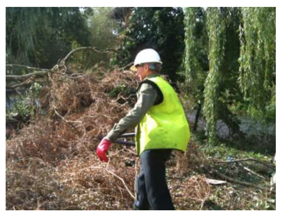
October Working Party continued