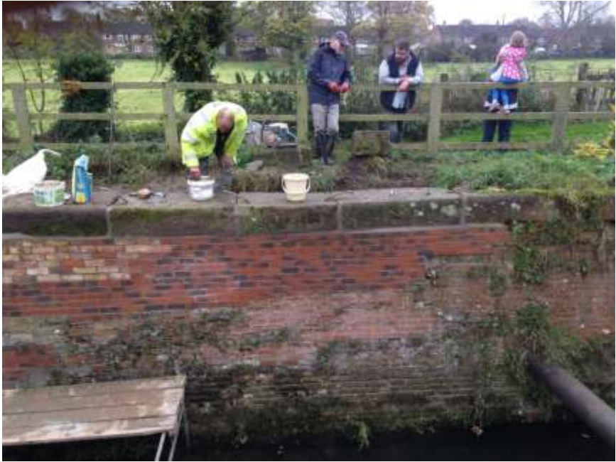
Oh dear.. one worker plus four supervisors equals...?