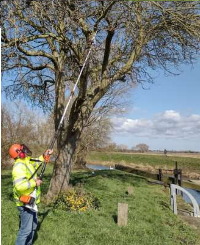
From the training course (top left) and then the equipment in practice at Taylors Lock