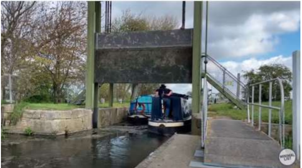
Photo: Minimal List Perseverance and friends entering Taylors Lock heading downstream below South Kyme

The IWA's Silver Propeller Challenge has inspired boaters across the country to visit waterways less travelled and those who take part record their journeys, with photographs as proof, and score points towards an award. Partly motivated by this, two celebrity boating vloggers Minimal List have posted over 380 YouTube videos of their river and canal journeys.