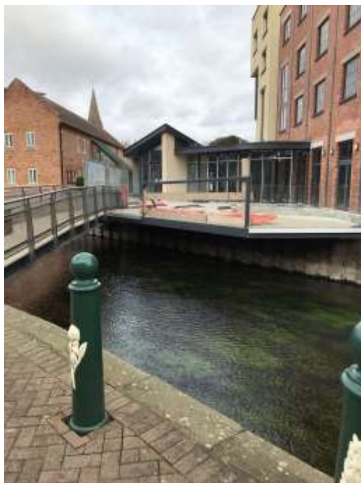
The new jetty... work in progress

In our newly created ground floor gallery, we are thrilled to showcase a collection of artworks created by our local community during lockdown, as part of NCCD Art Club.