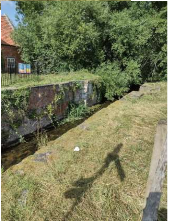
Fresh-mown locksides at Taylors Lock (above) and Cogglesford (right) July 2021