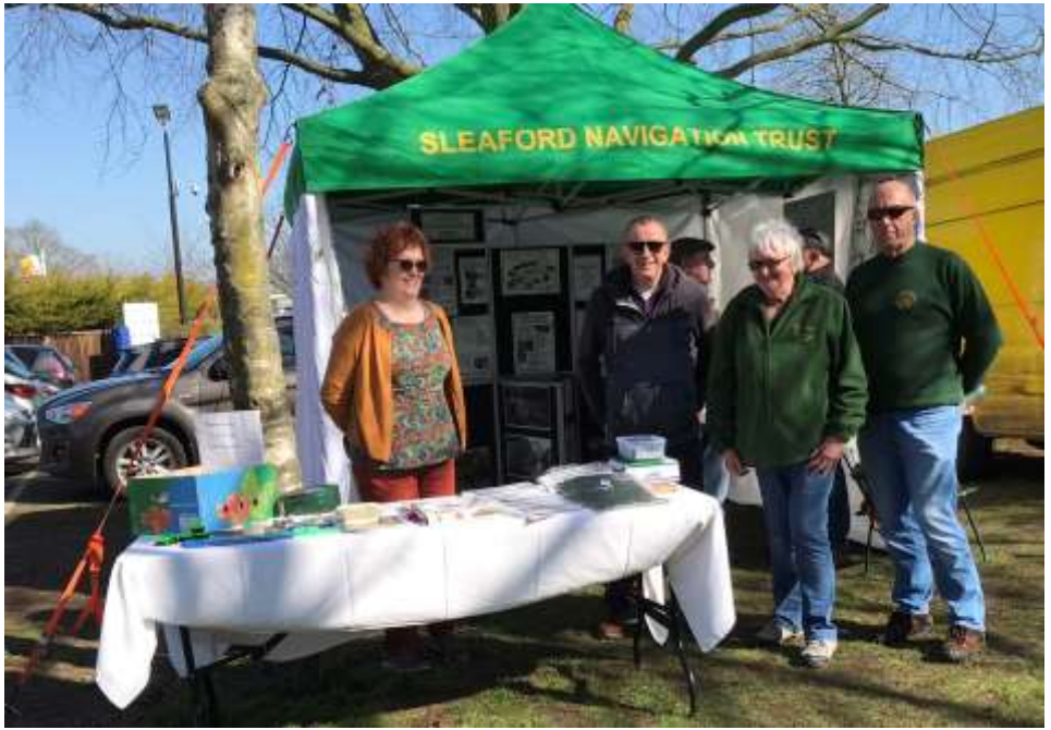
Our stand at RiverLight and, below, being visited by a pair of wandering pigeons...