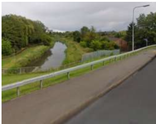
Grantham: The approximate site of the proposed junction in Grantham, just to the east of the A1 bypass

Rofe observed that the Grantham Canal headed east from Nottingham to Grantham and that, from Boston, the Witham and the Sleaford Navigation provided a good line westwards to Sleaford. He pointed out that there was only a distance of thirteen miles between the two ends of the respective canals. In his report he noted that “connecting these two lines will effect a short and certain line of communication by which goods may be conveyed in the same bottoms, (without liability to interruption) from all the canals connected with the Grand Trunk to the Port of Boston”.