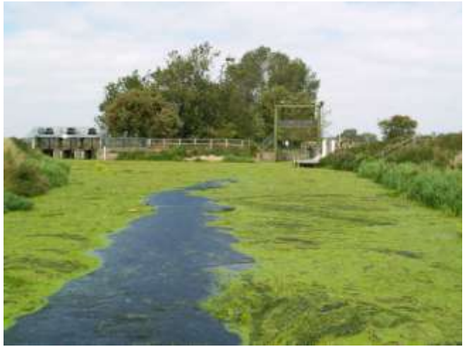
South Kyme - Bottom Lock

This excess of weed would, under normal flow conditions, be flushed down river to Boston Grand Sluice and then out on to the tide. With little flow the weed has built up, carpeting the width of the river and causing major problems to navigation.