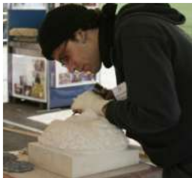
Young stonemason at work

too was fascinating. Particularly impressive was the intricate structure of some of the joinery pieces and the young age of so many of those taking part. It really is heartening to see such skills being practiced by men and women in their twenties and to see the obvious pride they have in what they have created. A group of apprentice stonemasons drawn from all over the country and beyond each worked on a section of a lancet window and the individual pieces were combined together as a finished window and displayed at the end of the day. What a perfect symbol of shared enthusiasm and working together!