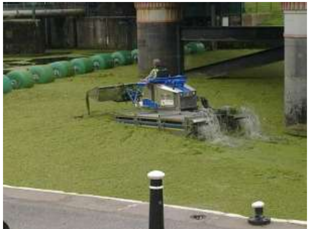
Weed clearing at Grand Sluice, Boston