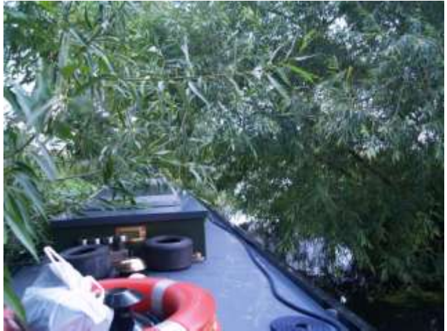
South Kyme – Overhead Weeds

The residents of South Kyme, on the River Sleaf, had reported their concerns to the EA and requested a meeting in the village. This took place on the 22nd September when representatives of the IWA and Sleaford