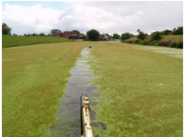
River Witham at Tattershall

In the meantime Internal Drainage Boards have presented photographs and details of the problem to Lord Henley, Parliamentary Under Secretary of State for Environment, Food & Rural Affairs, and a senior official of Defra's Chemical Regulation Directorate. The