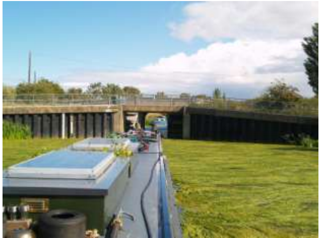
Chapel Hill – Pointing doors

In October BW applied for permission to vacuum the weed off the river and dispose of it on the banks. The EA are proposing to install floating barriers across the adjacent water courses that are the main source of the weed into the Witham. As a final and extra precaution the idea of narrow boats being