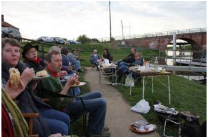
The alternative boat gathering

Bridge and boaters relied on those with access to cars to ferry them into South Kyme so that they could see the scarecrows, visit the Table-top Sale in the Village Hall, go to the Church Service and enjoy Sunday lunch at the pub.